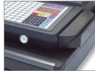
■ The SPS-500 Series has Magnetic Dallas & (Opt.) Mag Card Reader.