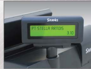
■ The SPS-500 Series has an adjustable Rear Customer Display.