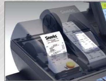
■ The SPS-500 Series has Single & Twin Station Thermal Printers.