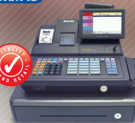
SPS-520 ECR TOUCH SCREEN POS SYSTEM