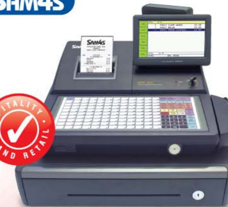
SPS-530 ECR TOUCH SCREEN POS SYSTEM