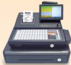
SAM4s ■ SPS-530 Single Station 80mm Thermal Printer (Raised or Flat K/B)