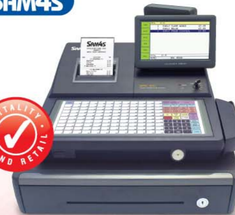
SPS-530 ECR TOUCH SCREEN POS SYSTEM