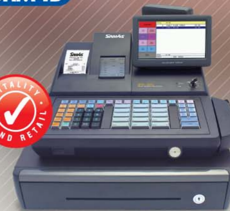
SPS-520 ECR TOUCH SCREEN POS SYSTEM