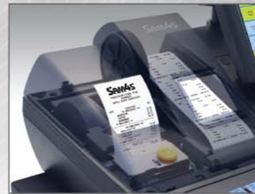
■ The SPS-500 Series has Single & Twin Station Thermal Printers.