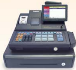
SAM4s ■ SPS-520 Twin Station 58mm Thermal Printer (Raised or Flat K/B)