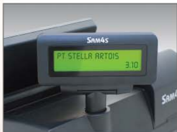
The SPS-500 Series has an adjustable Rear Customer Display.

Featuring a hybrid design, Sam4s has combined fast and simple ECR keyboard entry with an intuitive touch screen operator display.