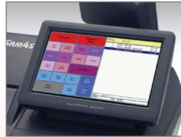
■ The SPS-500 Series has a 7" Touch Screen Operator Display.

Featuring a hybrid design, Sam4s has combined fast and simple ECR keyboard entry with an intuitive touch screen operator display.