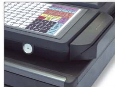
■ The SPS-500 Series has Magnetic Dallas & (Opt.) Mag Card Reader.