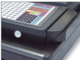
The SPS-500 Series has Magnetic Dallas & (Optional) Mag Card Reader.