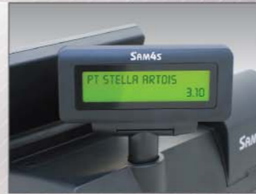
■ The SPS-500 Series has an adjustable Rear Customer Display.