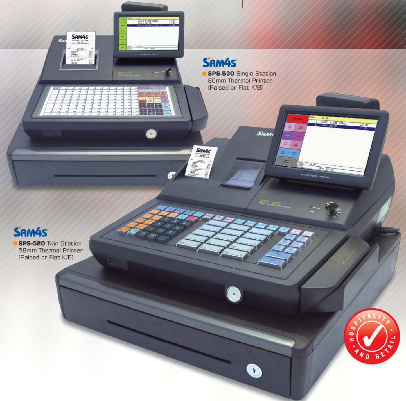
SAM4S ■ SPS-530 Single Station 80mm Thermal Printer (Raised or Flat K/B)

Featuring a hybrid design, Sam4s has combined fast and simple ECR keyboard entry with an intuitive touch screen operator display.