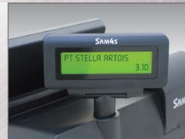
■ The SPS-500 Series has an adjustable Rear Customer Display.