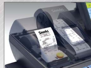
■ The SPS-500 Series has Single & Twin Station Thermal Printers.