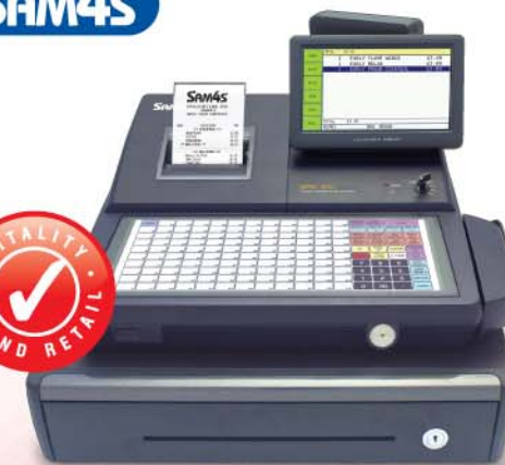
SPS-530 ECR TOUCH SCREEN POS SYSTEM