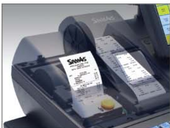
The SPS-500 Series has Single & Twin Station Thermal Printers.