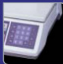
Membrane key pad