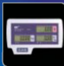
Client view pole display