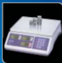
Dual interval technology