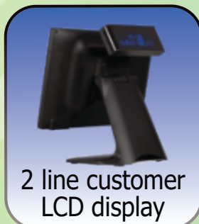
2 line customer LCD display