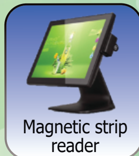
Magnetic strip reader