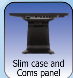
Slim case and Coms panel

See overleaf for all options, extras and specifications